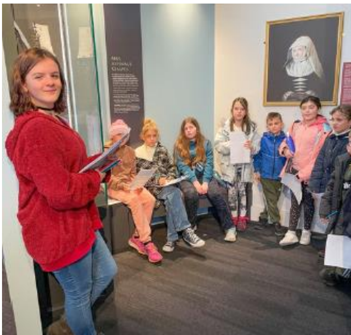
New Visuality 'art campers' during a drawing trip to Bar Covent for our Christmas 2022 HAF session